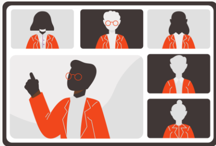
Conference / video calling platform