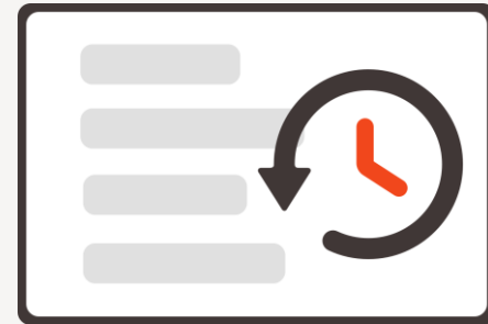
Historical reporting and analytics